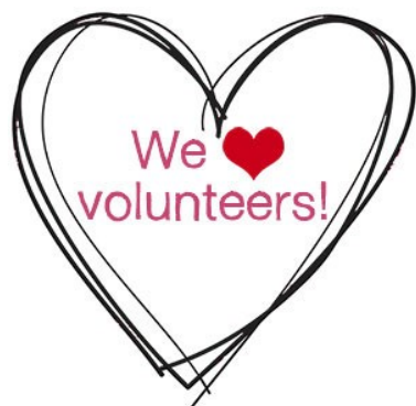
VOLUNTEER HOURS BY ACTIVITY